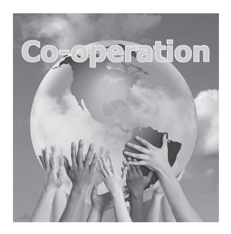
Keywords: Entrepreneurial Orientation, Collaborative Orientation, Business Sustainability, Small and Medium Enterprises

Built upon stakeholder theory, the paper introduces collaborative orientation, focusing on stakeholders and morality, as an additional approach to be integrated with the former one for business sustainability. Therefore, small and medium enterprises should adopt entrepreneurial and collaborative orientation for sustainable business success.